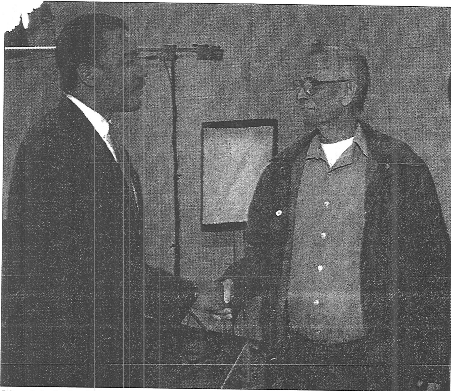
A handshake for the cameras: King, left, and Ray in their CNN moment